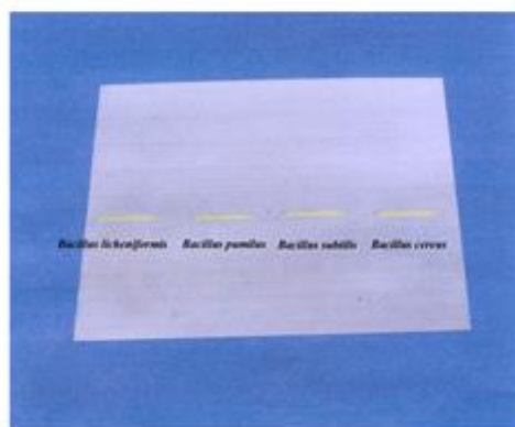
Plate - 3

Thin Layer Chromatography for Crude Extraction of Bioactive Compound