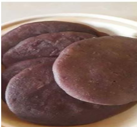
Plant of Elephant foot yam and processed corm 'Batima'

2. Alpinia allughas (Retz.) (Bamboo-leaved Galanga): It is a stout perennial herb with tuberous, aromatic roots belonging to the ginger family. Morphologically it is characterized by the presence of rhizome, simple, wide-brim leaves protected by showy bracts and terminal inflorescences. It is called as 'Thorai' in Tripura. In Tripura mainly the tender part of the stem after removal of the bracts is used as vegetables and preferred by many due to its pleasant aroma. The rhizome