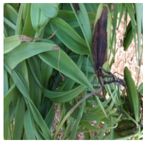
Virus disease of Glory Lily