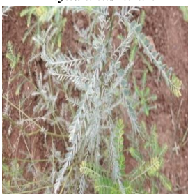
Powdery mildew of Phyllanthus niruri