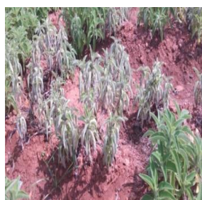
Alternaria leaf blight of Glory lily