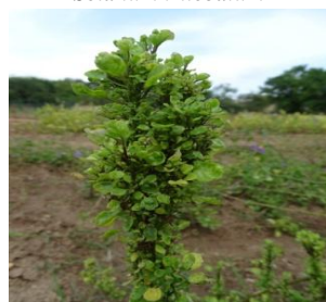
Phytoplasma disease of Solanum trilobatum