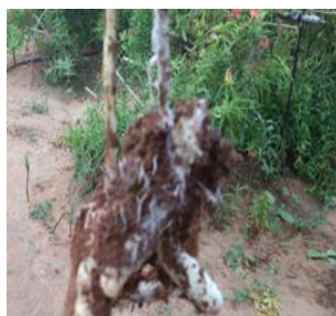
Phytoplasma disease of Solanum trilobatum