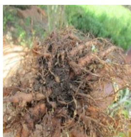
Root rot infected Glory Lily plants