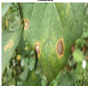
Alternaria disease of Black night shade